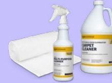
Janitorial & sanitation supplies ▶