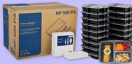
Restaurant supplies ▶