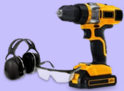
Industrial & MRO supplies ▶