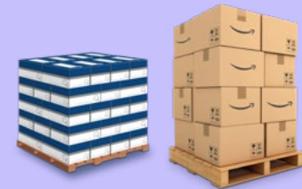
Wholesale purchasing ▶