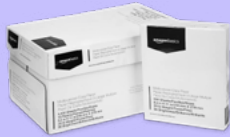
Office supplies ▶

Click the categories below for more information